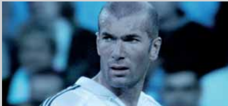
Douglas Gordon and Philippe Parreno's film "Zidane, a 21st-century portrait" which screens tonight (see p6) has been bought by MoMA and by the Guggenheim